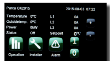
Eco series touch screen